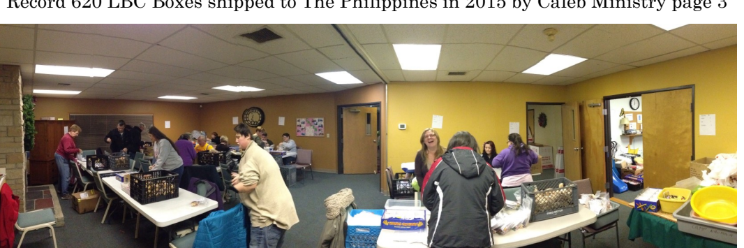
Record 620 LBC Boxes shipped to The Philippines in 2015 by Caleb Ministry page 3