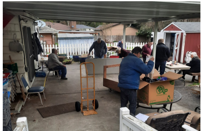
Inside this issue: